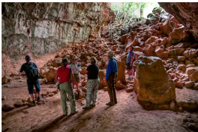
Tour group inside a lava tube - note the lady in blue shirt and cowboy hat - read text for her story.

Next morning Chris and I did most of the short walks in the park including Atkinson's lookout and The Bluff while Nicko had a