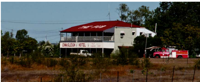
"The Pub" - Einasleigh

River so whenever I saw likely tracks for future investigation I entered them as way points in the Magellan. The track was only