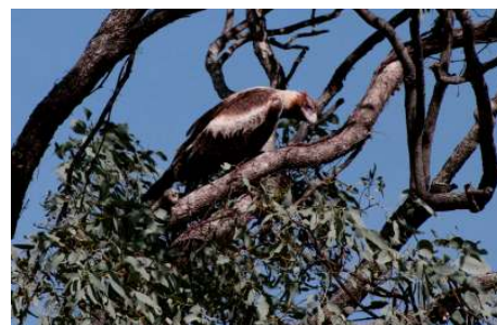
Undara residents - l to r - Pretty Face Wallaby, Noisy Friar Bird, Wedge Tail Eagle

hours in the morning before they depart is OK, or in fact just to charge their batteries when generators are banned (which is the same thing actually). The solution is to have lamb chops for dinner and save the bones, leaving some small portions of meat. Then discreetly heave the bones onto the offenders tent or caravan roof. This will ensure that he and his group will wake to one of the most wonderful sounds in the Australian bush. Half a dozen or so Kookaburras in full voice, right there next to his ear hole. It's likely that a couple of these morons were in the audience as there always are in larger camp grounds, so hopefully his humour may have hit home with some of them.