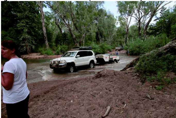
Crossing Lawn Creek - a couple of decent blokes standing in the creek as guides to miss the deep holes.

KFC to Lawn hill traverses Bowthorn Station and Lawn Hill Station. I think we counted 14 gates that had to be opened and closed over a distance of about 140Km. There was a lot more water about than 2008 and so there were a few wet creek crossings to negotiate.