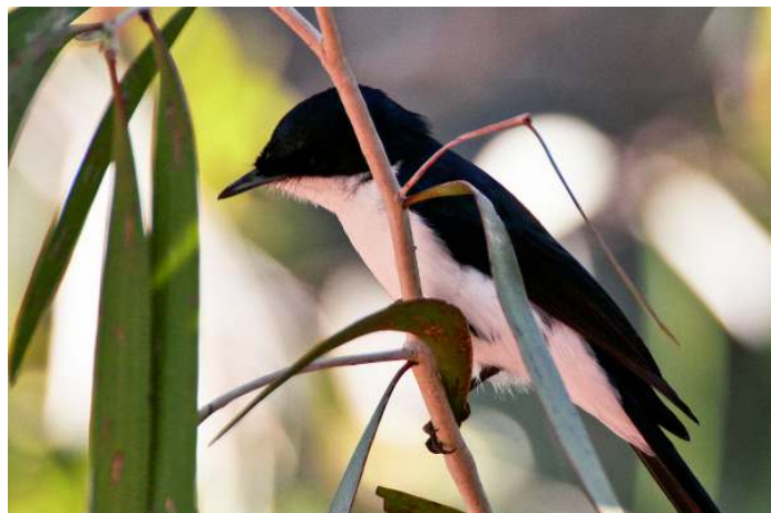
Restless Fly Catcher - Gregory River