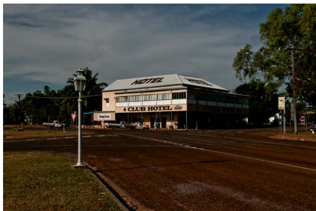
Club Hotel - Croydon

So to get away from all these people we headed for Burketown the next day. Very pleasant drive, now back on dirt, and so other than a couple of exceptions, void of caravans. We stopped at Leichardt Falls for lunch. There were a few others at Leichardt falls and a young "Hippy" couple decided that they needed a swim sans clothing. I think