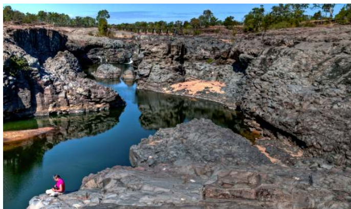
Einasleigh Gorge at Einasleigh - railway bridge in background

42 Km and a very scenic drive. Once we hit the main road we headed East to Mount Surprise which left about 50Km to the Undara camp ground. We set up camp in the non powered camping area. All things considered, this was a pretty good camp ground. Being away from the caravans on the powered sites was excellent as they were packed in cheek to jowl. We also booked into a tour of the lava tubes for the afternoon of the next day.