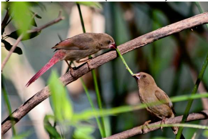
Finches Playing Tug-of-War - Gregory River