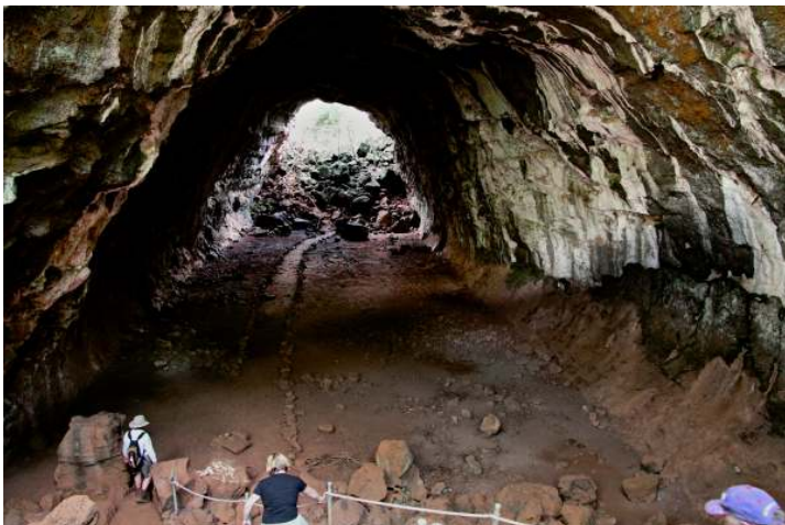
Lave tube - Undara