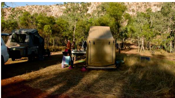
Our Camp at Butterfly Springs