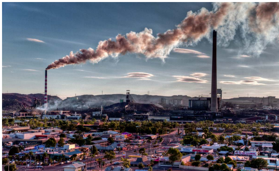
Surreal Image of Mount Isa - HDR ( not every bodies cup of tea - either the city or the style of photo.)

bad as it was a fairly still night. We headed off for the Barkly hwy the next morning and at Brunette Downs realised that if we had checked the map and completely filled up with diesel at Cape Crawford we could have taken a short cut to Mount Isa along a dirt road. Now it is not like us to not check all routes to where we are headed as we do not really mind what the roads are like and the minor roads are usually a whole lot more interesting and also void of caravans. We were soon to rue the error as after reaching the Barkly Hwy and a little more fuel at the Barkly Road House (also expensive but not quite as bad as Cape Crawford) we were about to set off for Mt Isa when we found out that the Barkly Hwy is to be closed for 4 hours due to a road train accident. Had we taken the short cut we would have by passed the accident. After some deliberation we decided that we would prefer to be at the scene waiting to get through, and the travel time to reach the accident would eat into the 4 hours anyway. The