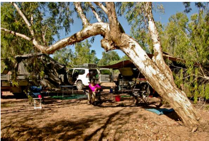
Our Camp on the Gregory - taken from waters edge

The RFDS seem to be always in the forefront of peoples mind in the outback, and when you hear some of the stories of how peoples lives have been saved in very remote area by this service it never ceases to amaze. So if you find yourself in an outback town or community you will not have to look very far for a donation tin and often there is some bazaar competition in the front bar of the pub in which the entry fee is a donation to the RFDS and if you fail it is even a bigger donation to the RFDS. Please donate wherever possible, Chris or I may need their services at some time in our travels.