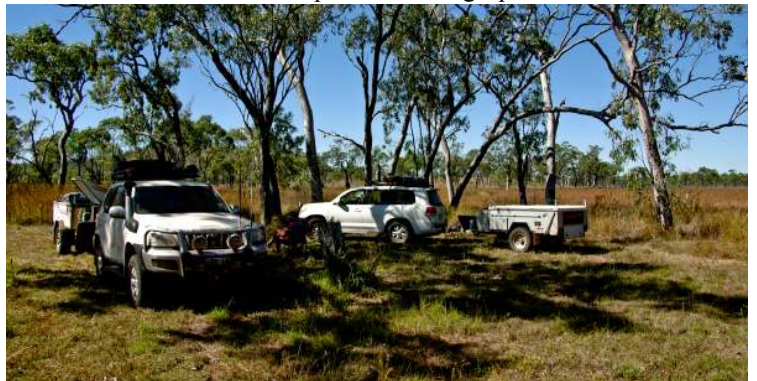
Lunch at Emu Swamp

"The Lynd", if you care to check it out, is a quite a well known old station that is mentioned in a lot of the history of the outback and is a few K's short of the junction where the roadhouse is sited. Well the drive from Blackbraes NP was about 90km plus the 17Km of 4WD and another 5 of dirt so it was past mid afternoon by the time we reached the roadhouse (and after all our lunches are generally fairly leisurely). The roadhouse campground was chock-