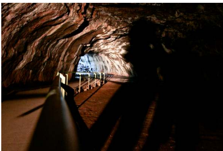
Lava tube - by torchlight.