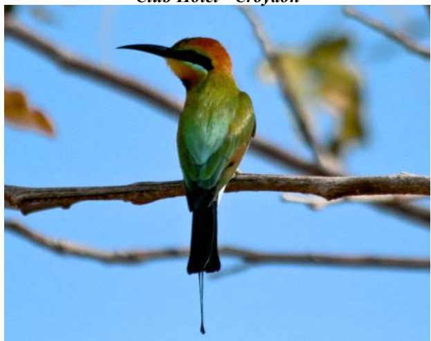
Rainbow Bee Eater - Karumba

everyone goes a bit troppo in the heat of the tropics but it did bring back memories of our 15 years in Darwin in the 70's and 80's when this behaviour in swimming holes on the side of the road was not at all uncommon. Leichardt falls was also a possible bush camp spot but we were fairly keen to make it to Burketown that day and it was after all, only lunch time. Arriving at Burketown was a little bit of a surprise after our visit in 2008. This year it was very busy and we were the last campers to be squeezed into the very small camp ground. Had we read our notes from 2008 we would have remembered that there was free camping on the river a few Kms away. Never mind, we only needed to stay a night and then head out to Kingfisher Camp (KFC) the next morning after fuelling up, and finding some supplementary supplies.