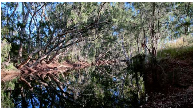
The Einasleigh River next to our emergency camp spot

ers, one of the problems of touring during schools holidays. Everybody that heads to Undara and Cobold Gorge from Charters Towers, Townsville and all towns south virtually have to pass through "The Lynd Junction". So after checking with the staff at the Oasis on possible camp sites in the bush we headed west towards Einasleigh along the Einasleigh River. About 25Km down the road we spied a track off to the left and head down it. What a pleasant surprise it was when we reached the river. The campsite was OK, but the river was an absolute treat. Had the place to ourselves except the following morning we were visited by a 4WD. As it approached we thought perhaps it was the landowner to check up on us but turned out to be an older couple coming to get their red claw pots. Red claw are a form of fresh water crayfish prevalent in the area and they were huge.