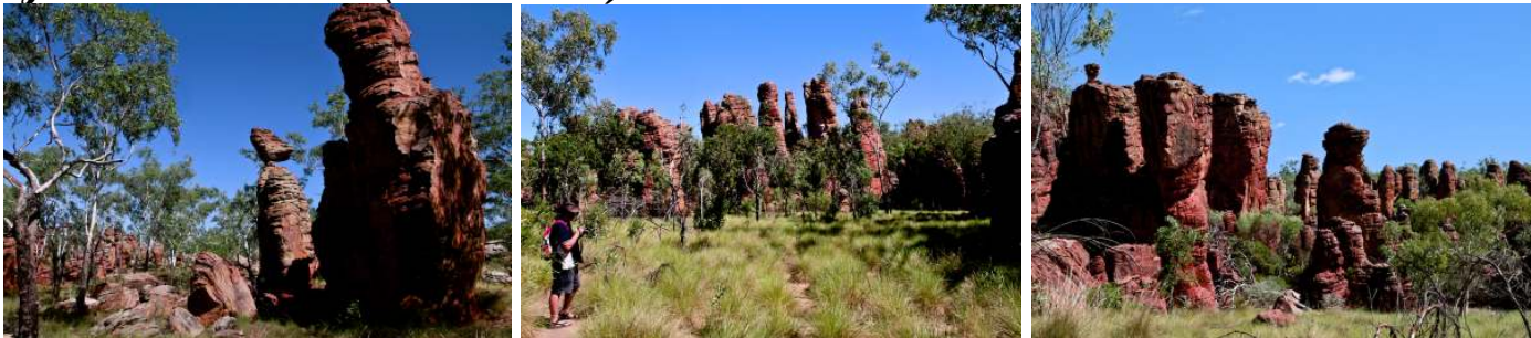
Southern Lost City - Limmen NP