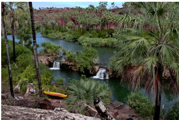
Lawn Hill NP