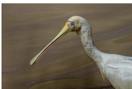
Yellow Billed Spoonbill

Noccundra is a popular spot for a number of reasons. People with caravans who want to go to Innamincka and the Dig Tree