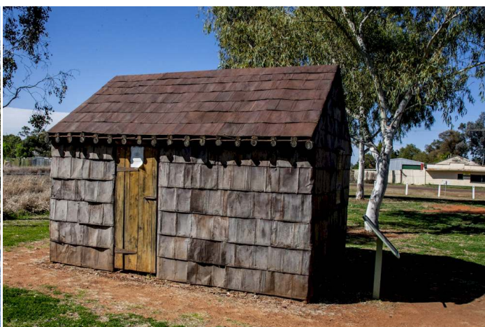
Kerosene can hut, Morven - many of these in the area during The Depression housing homeless families from the cities