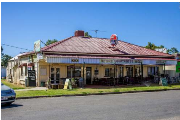
Courthouse Hotel - Mitchell

(few and far between in these outback areas). The gift shop is only open 3 days a week and we struck it lucky. So after a coffee and baked cheese cake, we set up camp at Fishermans Rest (after researching a couple of other possibilities). There is a weir on the Maranoa River which has created a wonderful water resource for the town. We were camped on clean white beach sand on the river bank and so decided to stay for 3 nights. The camping area was infested with scotch thistles which seemed a shame for such a great spot to be shortly rendered useless by the spread of the thistles. So we set to and cleared the area of scotch thistles:- our small contribution to the environment. Actually we should do our bit, as weeds are being spread by the likes