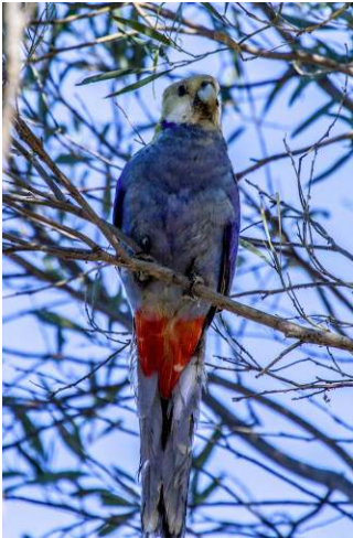
Pale Headed Rosella - listed as common but often hard to find and photograph. Should not have been in the area according to our bird book.