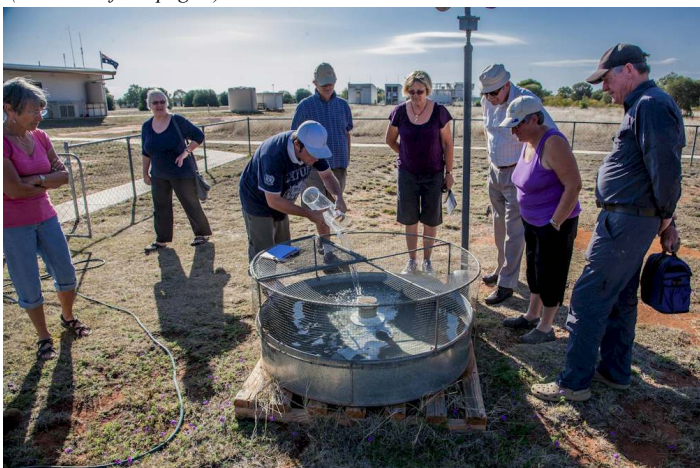
Doing the morning weather report - Charleville