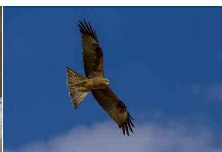
Black Kite on the prowl