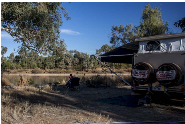
Our camp at Noccundra