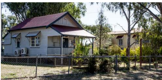
Quaint police station in Morven

Friday morning the 31st August, after taking delivery of the new phone, we headed a little further east to the