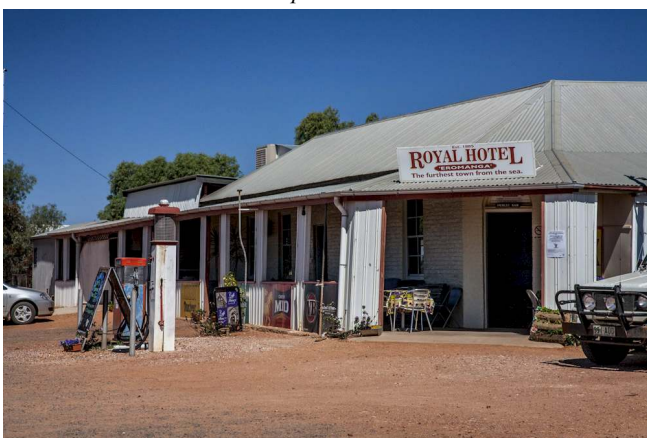
Eromanga pub. "The furthest town from the sea"