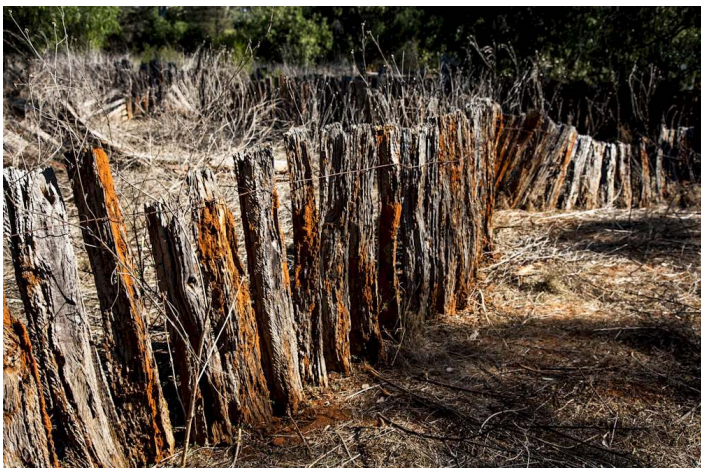
Stock yards Thrushton NP, taken over by the ants.