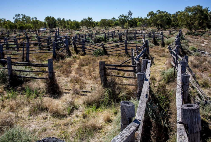
Old Cattle Yards - Culgoa Flood Plains NP