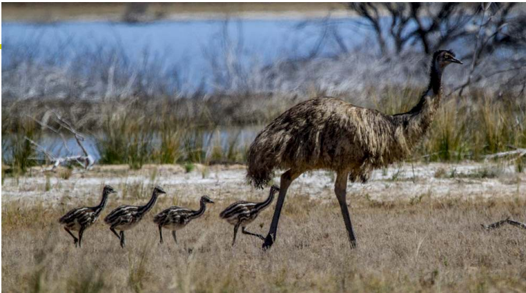
Must be spring time

The northern part of Lake Bindegolly is a national park whose southern border is just north of the main road that travels in an East/West direction. Just south of the road and on the southern part of the lake is a quite extensive bush camping area. So we decided to check it out. We drove in the access track as far as we possibly could, beyond the reach of caravans and set up camp in an area that I doubt has seen a camper for years if ever. We spent a total of 3 nights at the lake. The first two days were very windy and on the third day we set off and did a