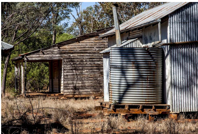
Ruins, shearers quarters, Thruston NP

On the morning of the 4th we stocked up with fuel, food and water, and headed for Thruston NP. Thruston is another park that is very remote and seldom visited. Again there was no obvious entrance other than a very non descript gate and a small sign that would easily be missed if not aware of where the park was supposed to be. In we went, and similar to Mariala NP, it was also supposed to be "patrolled". Once again there was no evidence of anyone, including rangers having been there at any time recently. So we set up camp by some ruins of shearers quarters and a shearing shed. Later that afternoon, bugger me if we don't hear the sound of a car coming through the bush. A younger couple who had come into the park looking to do some GPS based hiking. Each of us stayed 2 nights. We figured that was the most visitors the park has had in the last 12 months, and certainly the most that it has had at the one time