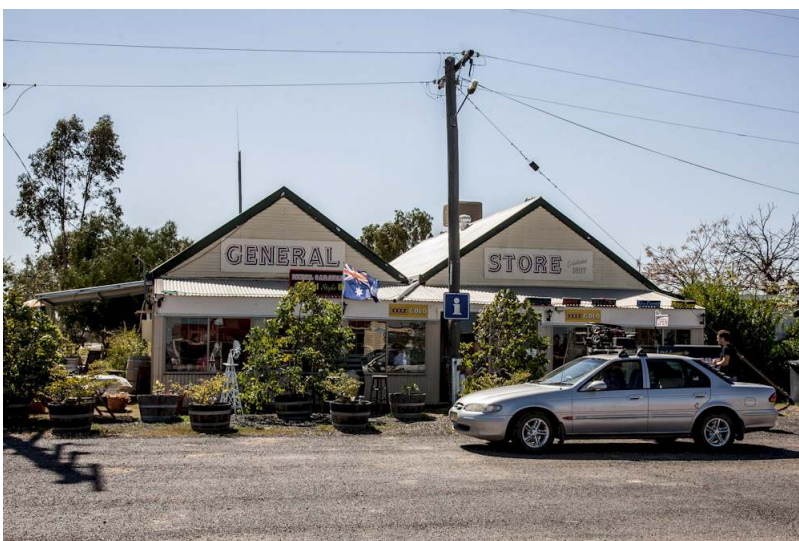
Hebel General Store - its name does not engender any great expectations but if you are ever heading north from Dubbo on your way to Longreach, do not fail to drop in. It is an absolute delight. Friendly, quaint, wonderful décor and great tucker. (See story next page)

Many people we had spoken to in our travels this trip had sung the praises of Bollon as a place to camp on the Wallam Creek and while it wasn't too bad, and the community provides free showers and toilets, we decided that it wasn't for us and moved on but only after having chatted to the lovely older lady in the information office for an hour or so. You think many of these very small outback towns just continue on with a minimum amount of community issues, but when you scratch the surface you find some rather frustrating issues for the residents that are completely confounded by city based bureaucrats. Now the Government wants them to hand over the houses that they have had built with government funding to help them attract trades people such as mechanics, electricians etc., to the community to enable the community to function in a normal manner. But the government now wants to put unemployed homeless people from the city into them and eject the current tenants. When you think about that it is mind blowing. Homeless people need support from various services that are not available in towns like Bollon. And what on earth are unemployed people going to do in Bollon as there are no jobs there anyway.