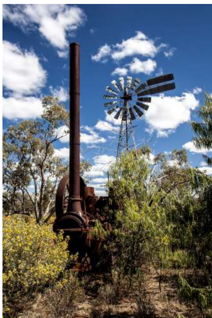
Magnificent old Steam Engine - Mariala

Not that we were that far away from people (only 60 km to Adavale) but I doubt if there has been a patrol or visitor into the park in 12 months or more. There was certainly no evidence of anyone having ever camped there at all. If we were to have run into car trouble or had an injury of some sort we were faced with a walk of 13 km to the infrequently used road (Adavale to Charleville). When we set out on this years adventure we did not