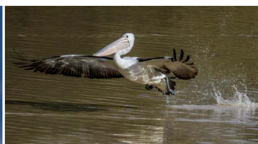
Common but great to photograph