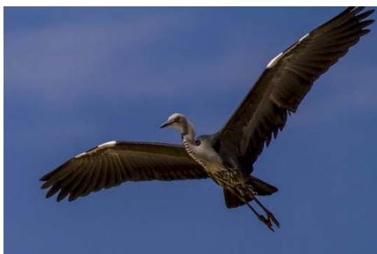
White Necked Heron - very photogenic.

often leave their caravans at Noccundra and then tent it into Innamincka. Additionally the water hole here (the Wilson River) is Carp free and offers some good fishing and plenty of Yabbies (or as the Queenslander call them "Red Claw" but they actually have blue claws :- Queenslanders?????).