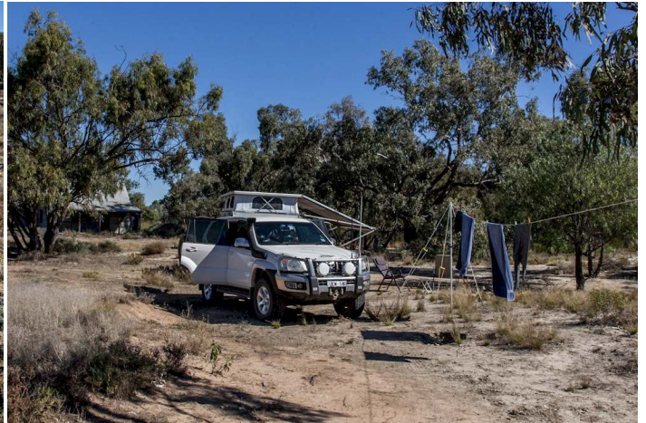
Camped on dam at Red Bank Hut - Culgoa Flood Plains NP