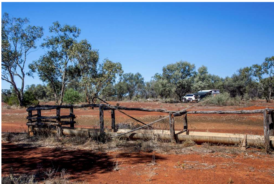
Mariala Camp - very isolated

think that we were going to be travelling in areas that were as remote or unfrequented as previous years. For this reason we did not renew our sat phone contract and so were only able to rely on our UHF radio for communication. In the case of a problem we would have to hope that a radio call coincided with the occasional passing vehicle who was monitoring the frequency that we chose, travelling along the road 13 km away.