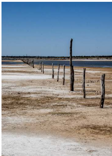
Reminder of times past at Bindegolly

10km walk into the national park. Some of the walks were closed as the lake is unusually full, cutting off the tracks. Each morning flocks upon flocks of Little Cormorants would head northward past our camp heading for the northern end of the lake, and then each evening at dusk, these thousands of Cormorants would pass our camp heading south to roost for the night, some of them roosting in the bushes and dead trees near our camp. The following morning they would once again head to the northern end of the lake. Why on earth they do this we have no idea as one would think that there is plenty of opportunities to roost anywhere in the lake. However it made a very interesting scene as they were silhouetted against the red sky at dusk (see photo page 1).