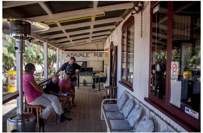
Checking out "Outback Australia - volume 1"

last visit and it was now owned by Koss, a music teacher who doesn't drink. Very nice bloke and the pub had two other customers, a younger couple who were camped nearby. This pub specializes in beer and "ding" food.