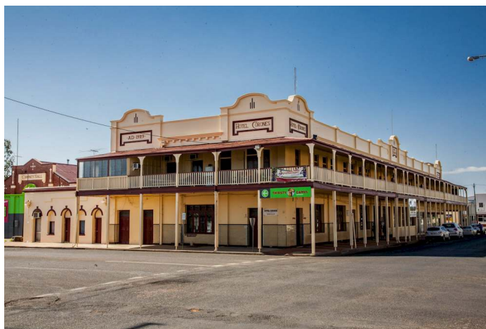
Hotel Coronas - Charleville

Charleville. The upside, other than our visit to the Weather Station and the Cosmos Centre where we looked at the sun through a special telescope, we were also in town for our wedding anniversary. So we dropped into the Telstra shop and asked the girls about what restaurants were in the offing.