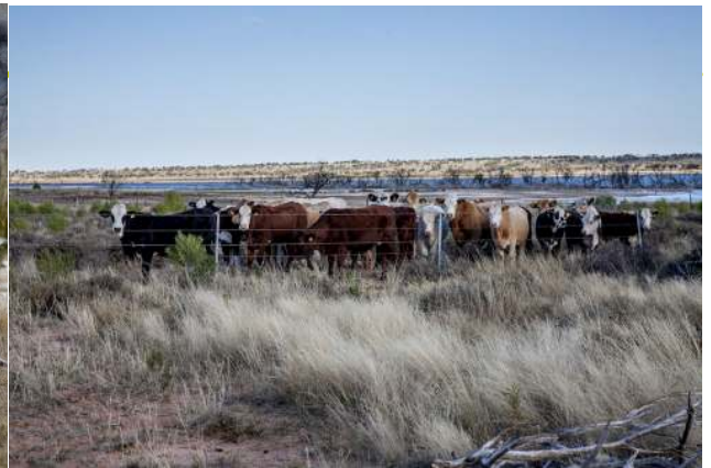
Our curious neighbours at Bindegolly