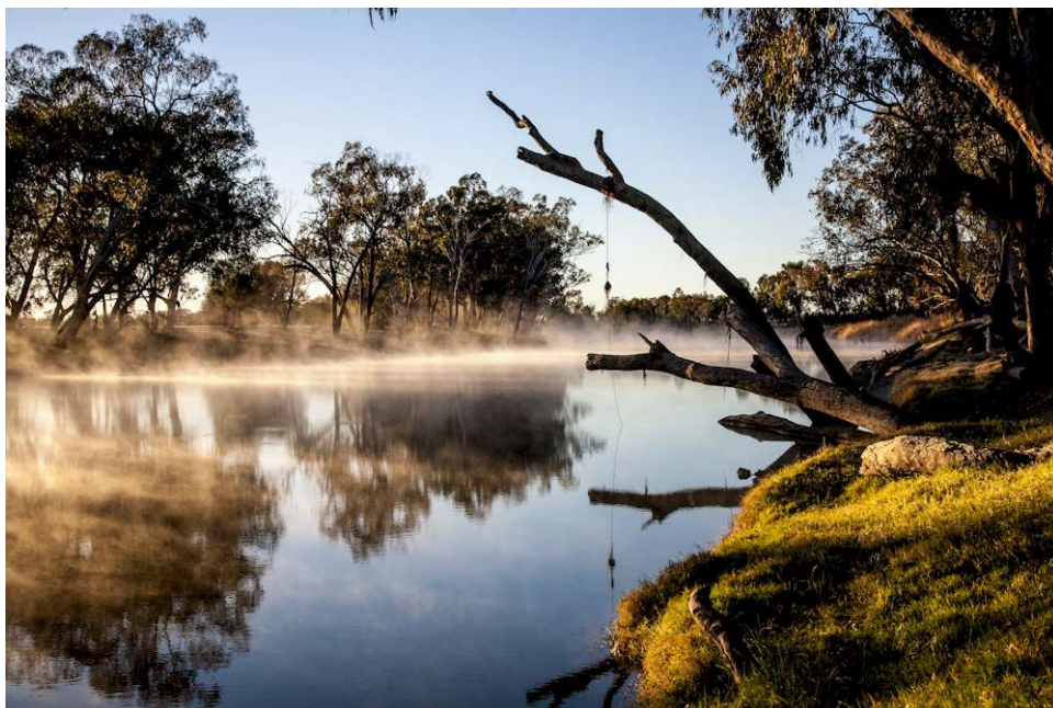
Maranoa River, Mitchell - chilly mornings, brilliant days