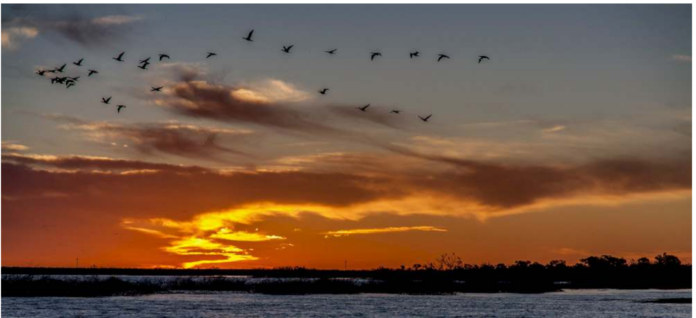
Little Black Cormorants heading south to roost for the night - (see story).